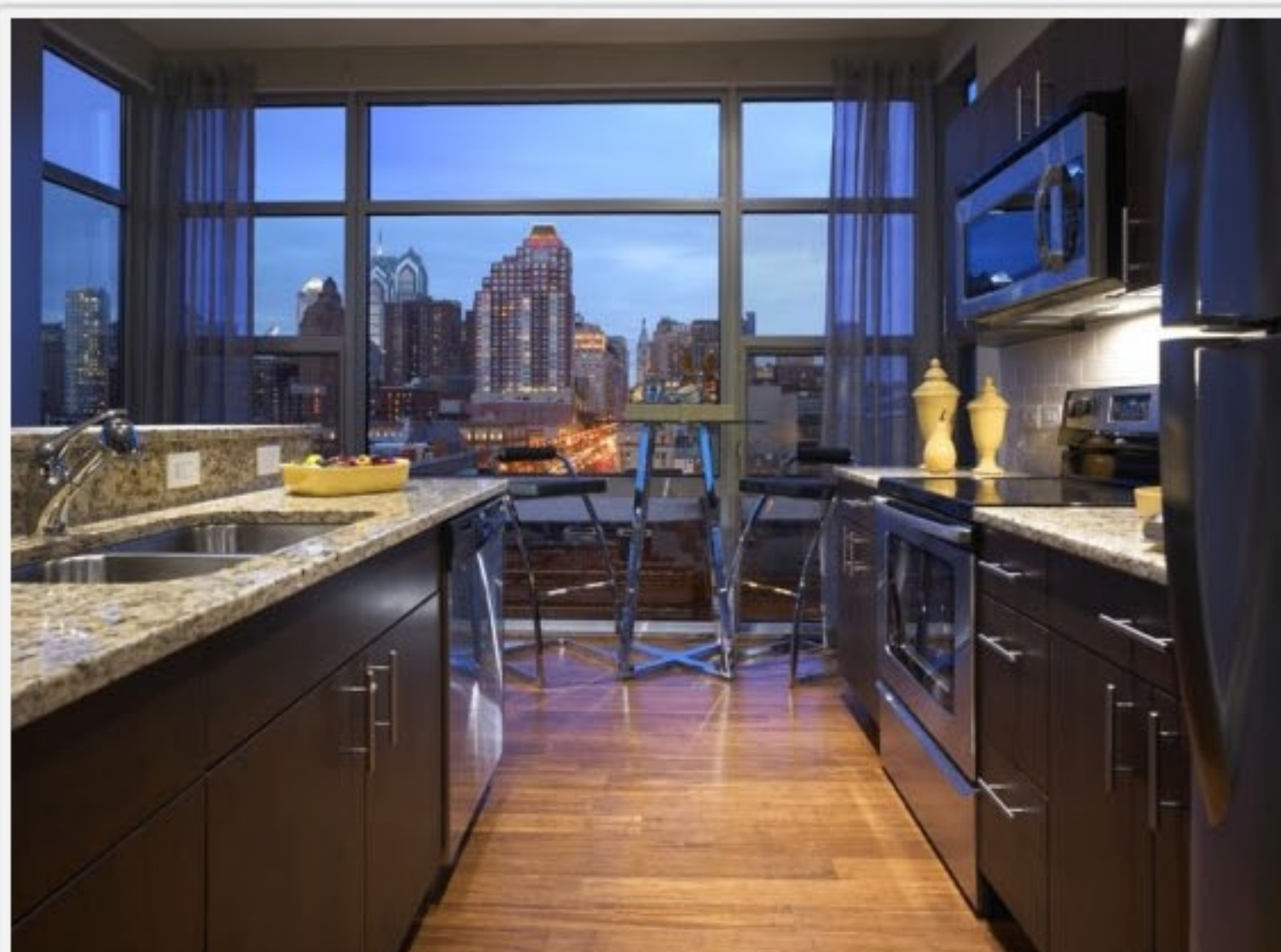
A closeup of a kitchen

The building contains 146 residential units on floors 2-5. Each unit comes with a parking space and a storage unit down the hall. Apartments have large windows, high ceilings, and bamboo floors, making the space look large and bright. Kitchens include stainless steel appliances and granite countertops. Residents can control the climate in their individual unit thanks to a heat pump system.