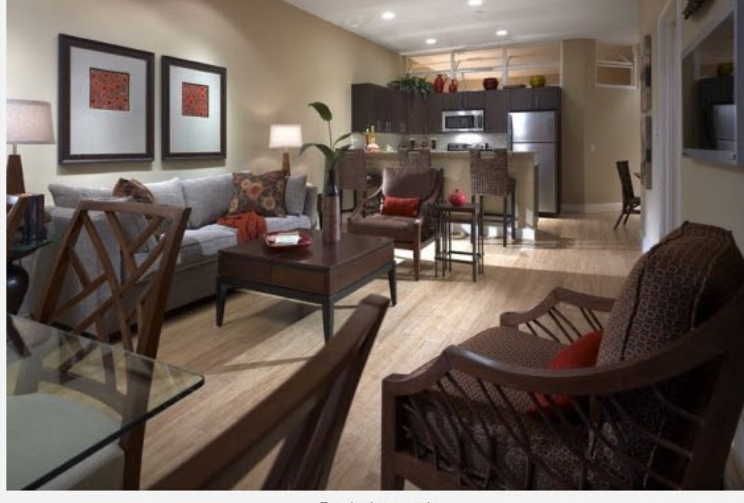
Two bedroom unit

The Club Room and Fitzwater Pub are two common spaces on the first floor of the building that host events for residents and the community. When these spaces are not reserved, residents are usually socializing in the comfortable environment or watching a ballgame. The building also includes a fitness center for residents, which eliminates any excuses for not working out. Darn.